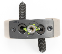
Zero Profile Plate